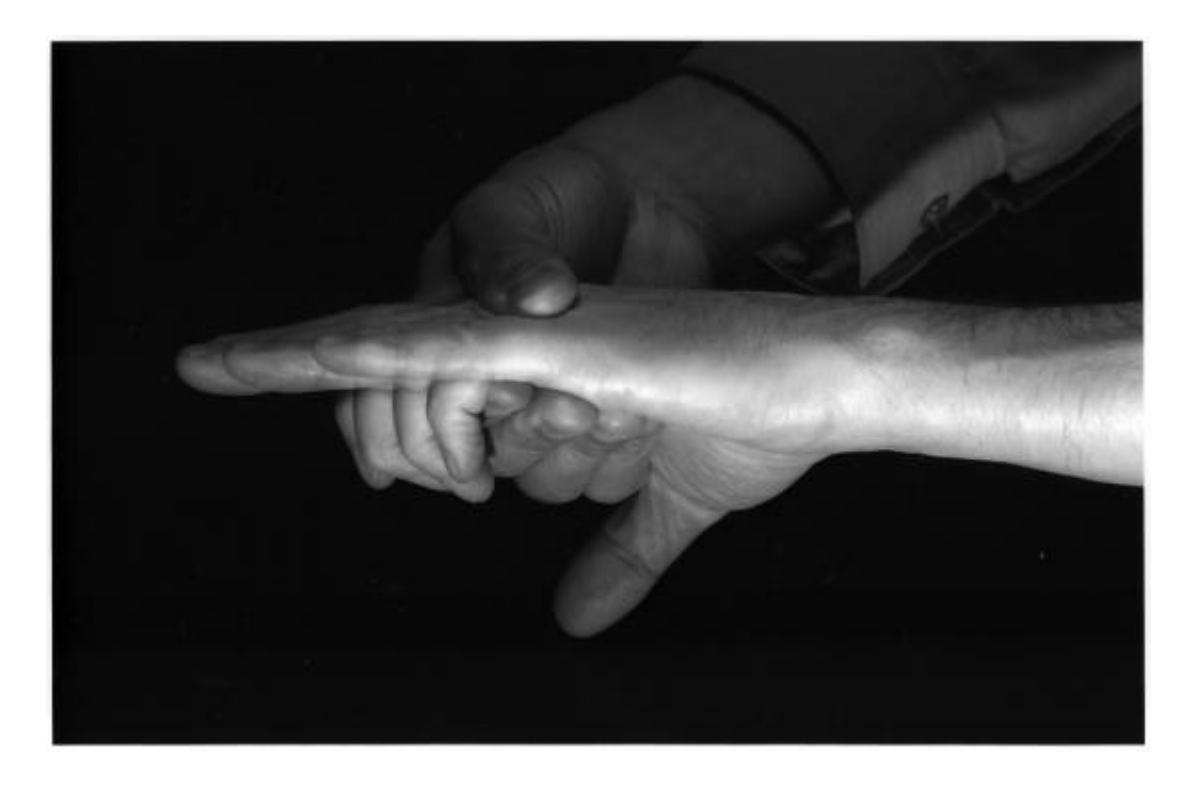
Figure 2. Test for compartment syndrome of the hand: flexion of interphalangeal joint with metacarpophalangeal joint in extension

Author information: Warren B Leigh, Registrar, Orthopaedics, Dunedin Hospital, Dunedin; Vasu S Pai, Senior Registrar, Orthopaedic Department, Wellington Hospital, Wellington